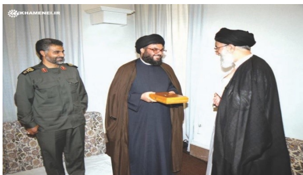
Qods Force commander Qassem Soleimani, Hassan Nasrallah and Ayatollah Ali Khamenei in Tehran in 2000

In 2006, Israel and Hezbollah fought a 34-day war that cost destruction for both sides. Almost 1200 Lebanese and 170 Israelis